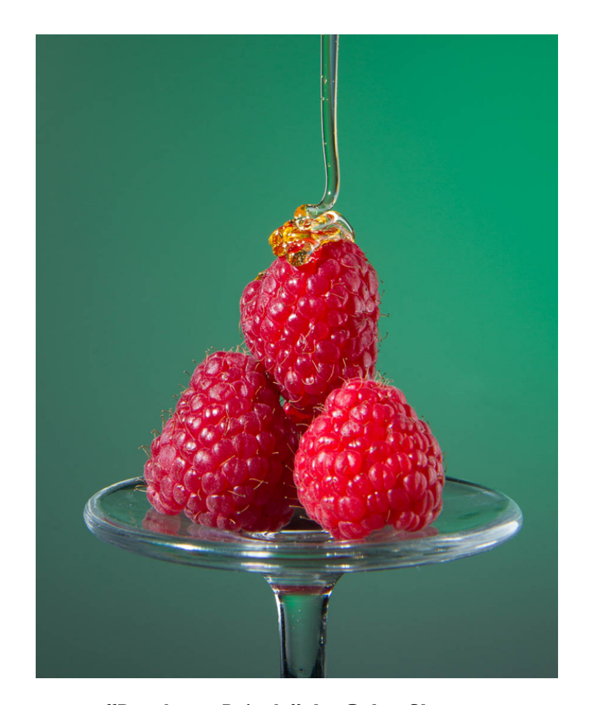
"Raspberry Drizzle" by Galen Short